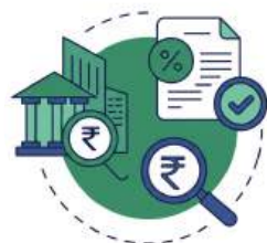
Tax Due Diligence for Mergers & Acquisitions