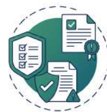
Regulatory Compliance & Risk Mitigation