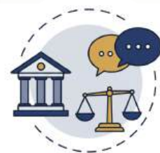
Representation in Appeals & Dispute Resolution