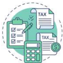
Tax Advisory & Compliance